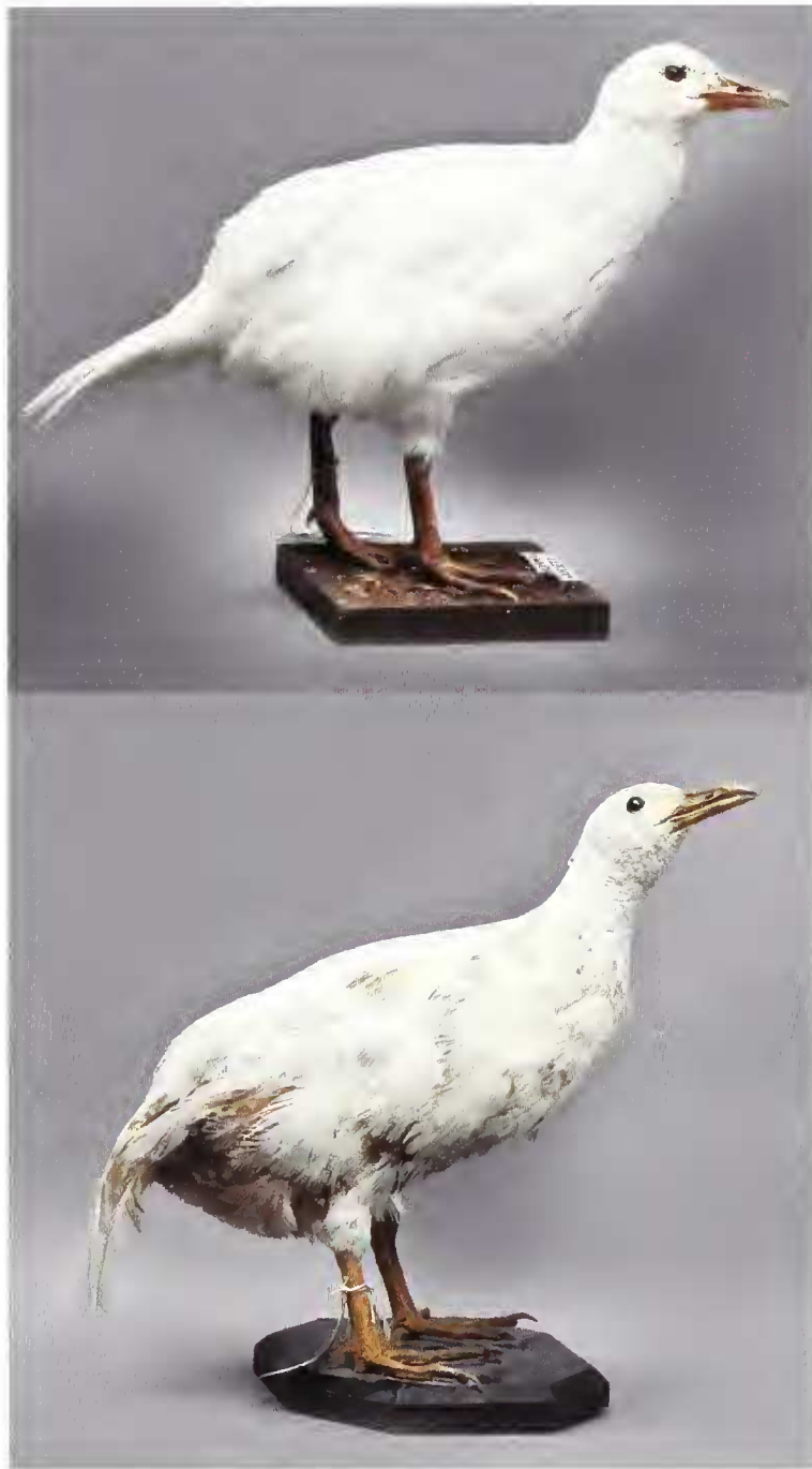
Figure 15. Two specimens of Weka Gallirallus australis showing different stages of progressive greying; top: NHMUK 2004.15.419 (in the final stage of progressive greying), below: NHMUK 1939.12.9.3710

wrote to him from Rangitikei: 'I obtained two specimens of Pukeko [Swamphen] which are partial albinos, but the pure white one I had seen I was not able to get, though he was seen again'.